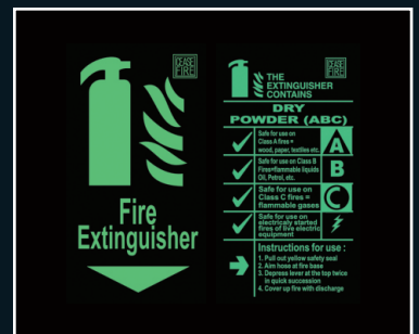
Photo-luminescent Fire Extinguisher Signs allow people to locate and easily identify fire extinguishers in the dark. In the event that a person does not know how to use the fire extinguisher, these signs also make it possible for him / her to easily read the usage instructions before attempting to fight the fire.