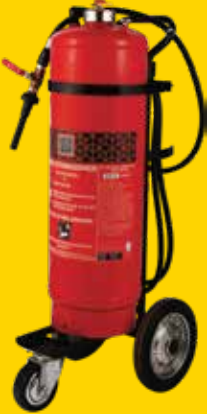
Water 50 Ltr.