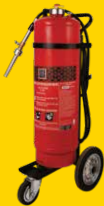
Foam 50 Ltr.

*Please check specification before ordering. Specification can change without notice due to continuous R & D.