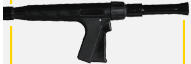
The Discharge Gun

A few seconds. That's the time it takes to turn the valve on the Ceasefire Plus and get it ready to take on the flames. This quick activation is what makes this product truly a revolutionary firefighter. Once activated, all you need to do is aim the hose in the direction of the flames. The Plus does the rest.